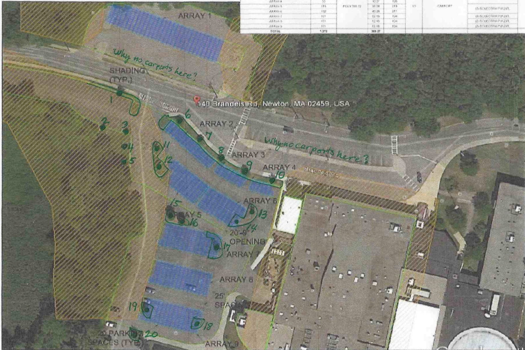
NEWTON SOUTH HIGH SCHOOL PARKING LOT - OVERALL ARRAY LAYOUT